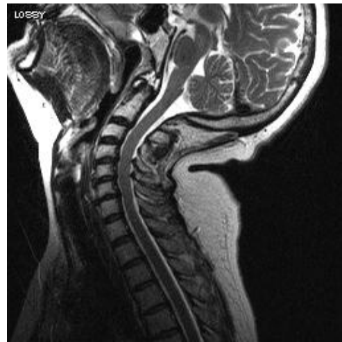
FIGURES 4 & 5

EXTENSION: Head and neck are bent backward. Above: Extension MRI of the cervical spine.