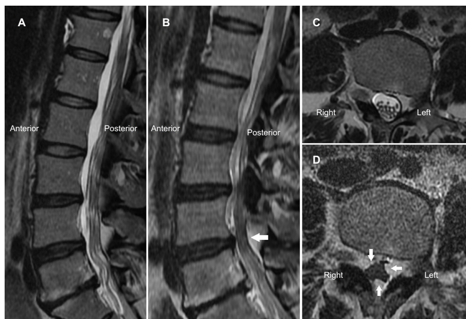
Figure 1 T2W Sagittal and axial MRI studies of patient I.

MRI studies: The first MRI study was performed in October 2013 (Figure 1A, C). T2W sagittal and axial sections demonstrated L5–S1 discopathy with a left paramedian disc protrusion. Discrete cauda equine nerve roots were easily identified on both sagittal and axial sections. The second MRI was performed in August 2017 (Figure 1B, D). No major changes were demonstrated in the degenerative findings or the herniated disc. However, sagittal sections showed clumping