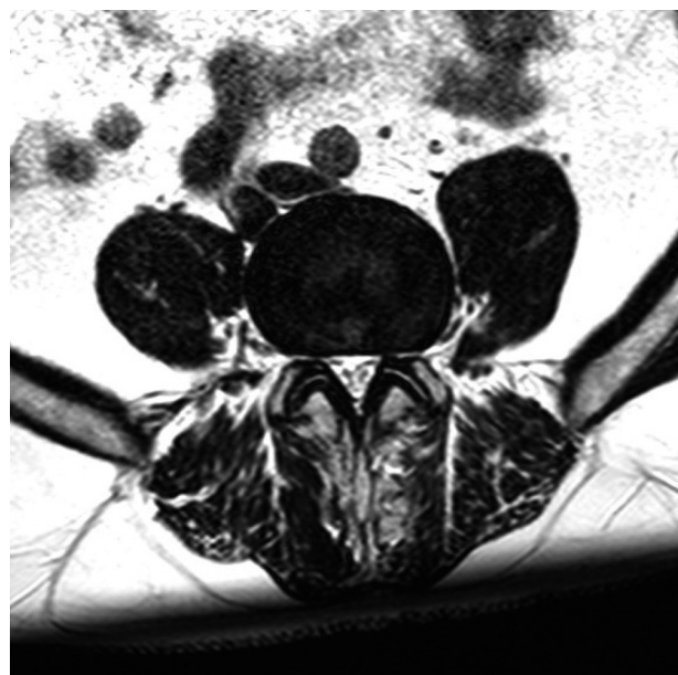
Fig. 2. Axial section of L4/L5 before the epidural steroid injection.