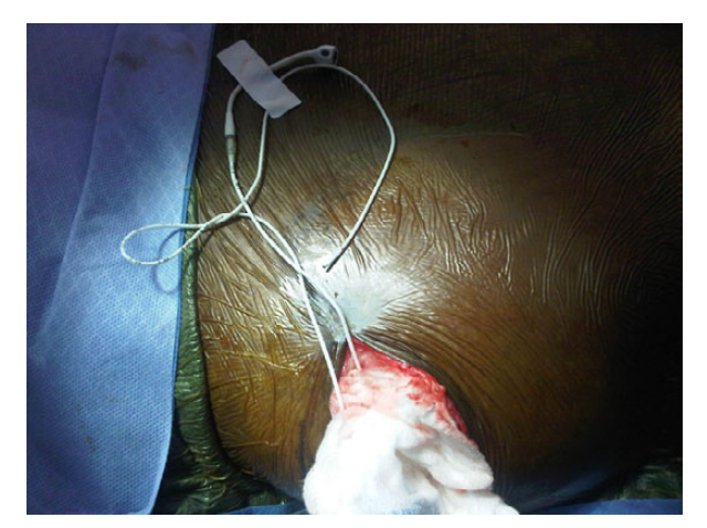
Figure 3 Anterior pocket containing pump and entire catheter.

showing artifact initially interpreted as intrathecal