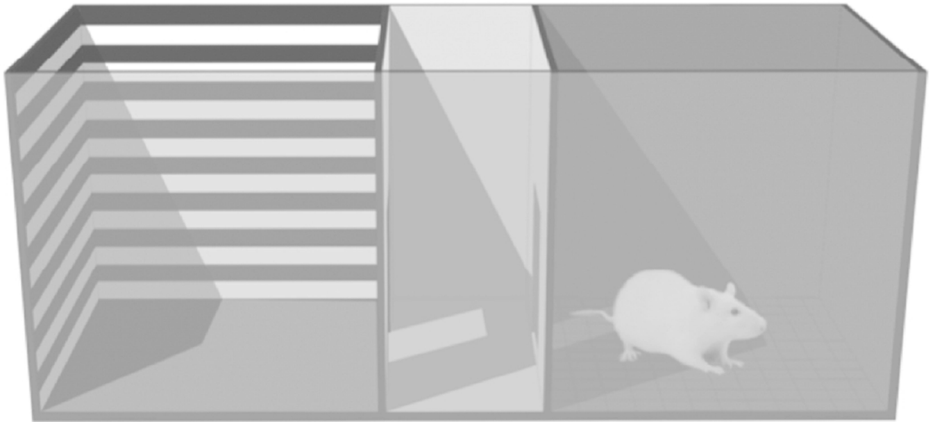
Figure 2. Conditioned place preference (CPP) paradigm

CPP can be used in rodents to reveal the presence of ongoing pain and the reward elicited by pain relief. CPP boxes usually consist of two conditioning chambers distinguished by different sensory cues that are connected by a middle (neutral) chamber. On pre-conditioning day, animals are placed into the CPP boxes with access to all chambers and the time spent in each chamber is recorded to ensure no pre-conditioning preference. During conditioning, animals will learn to associate one pairing chamber with vehicle treatment and the opposite chamber with pain relieving drug treatment. On test day, animals are placed drug-free in the CPP boxes with access to all chambers and time within each chamber is recorded. Increased time spent in the previously drug-paired chamber indicates preference for the pain relieving treatment.