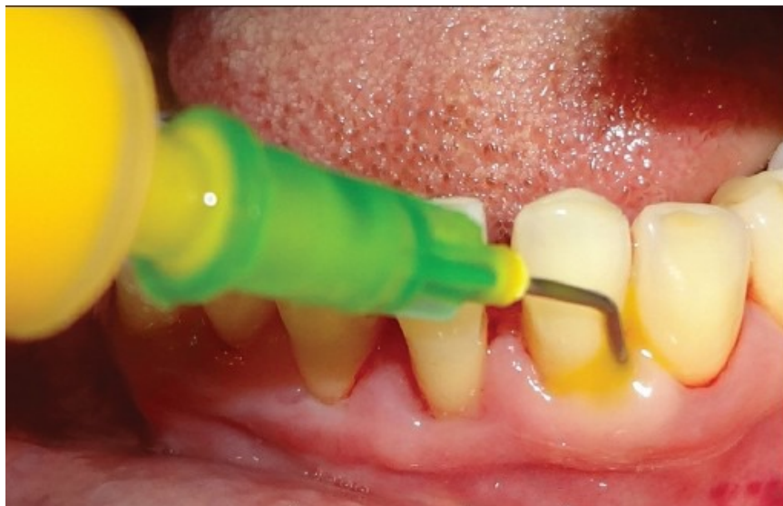
Intrasulcular application of Perio Q gel