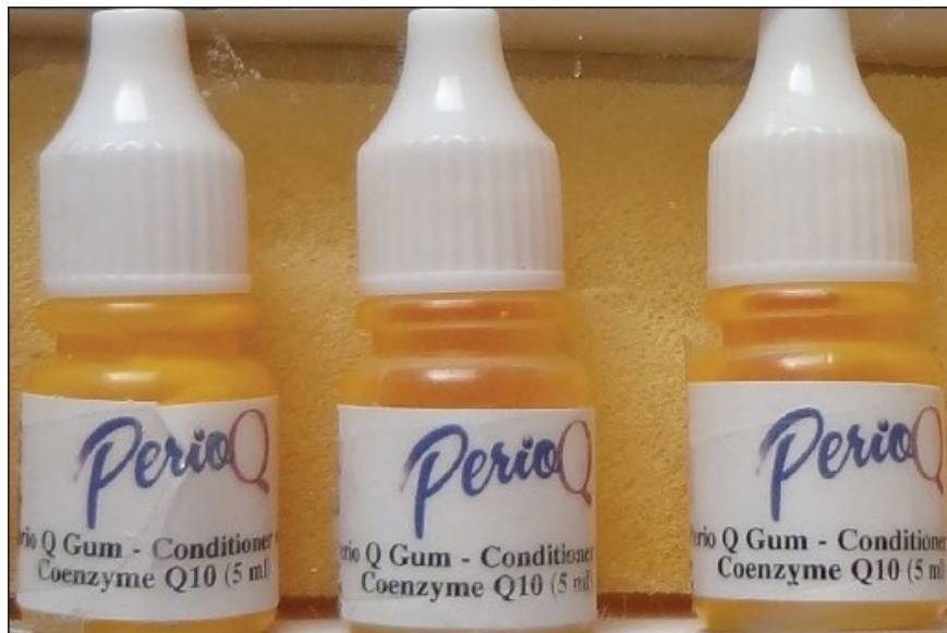
Perio Q gel