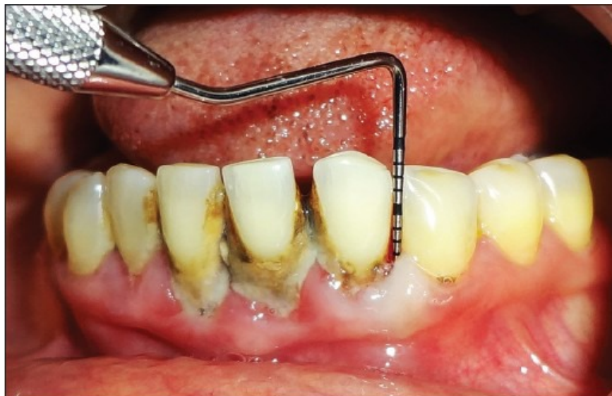
Probing pocket depth