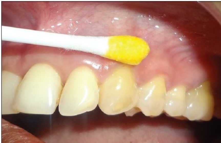
Topical application of Perio Q gel