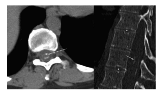
Figure 1 CT scan of thoracic spine: axial soft tissue window image (left) and sagittal reformatted image (right) demonstrating tram-like intrathecal calcifications (arrows) delineating the spinal cord compatible with arachnoiditis ossificans. Stars represent incidental finding of Schmorl's nodes.

Our top differential diagnosis was cauda equina syndrome. Other possible differentials that could mimic symptoms of our patient were spinal cord tumours, syringomyelia, complex regional pain syndrome and multiple sclerosis which were ruled