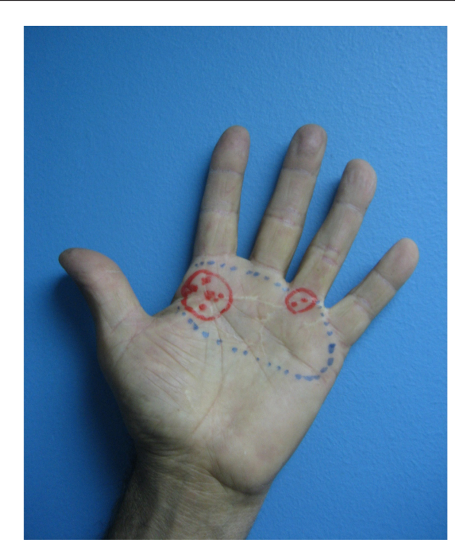
Figure 3 Painful surface area before (blue area) and after (red areas) treatment with 5% lidocaine medicated plaster (LMP). Abbreviations: NRS, numerical rating scale; LMP, 5% lidocaine medicated plaster.

This patient is a 58-year-old male, a mechanic, who suffered a high-voltage burn (12,000 volts) to his left hand which affected the collateral nerves. This trauma produced severe (NRS 8/10), persistent, neuropathic pain (DN4 9/10) in the palm of his hand, accompanied by intense allodynia. The painful surface area (outlined in blue in Figure 3) extended over 21 cm<sup>2</sup>. Pain interrupted his sleep and interfered with his work, preventing him from manipulating the tools that he had used prior to his accident. Over a period of two years and three months, the pain proved resistant to analgesic treatment. A range of analgesic drugs and schemes were tried, both singly and in various combinations, which